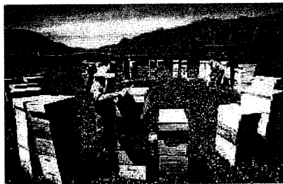
Bee Keeping in New Zealand